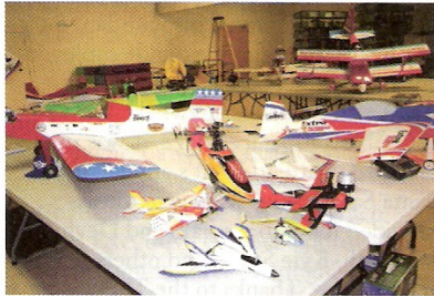
The Sky Sharks' display at the Barlow Library.

We all have a great passion for our hobby and enjoy showing our models and flying skills to everyone who will look and listen. The Vienna Sky Sharks Model Airplane Club of Vienna, West Virginia, was recently featured in a family flying event sponsored by the Barlow Branch of the Washington County Public Library. The program provided the Sky Sharks the opportunity to showcase the building and flying of RC aircraft.