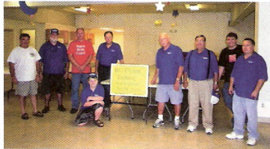
The Sky Sharks club proudly announces its library exhibit.

mradcliff@suddenlink.net 199 Heron Dr., St. Marys WV 26170 Tel.: (304) 684-2133; www.amadistrict-iii.org