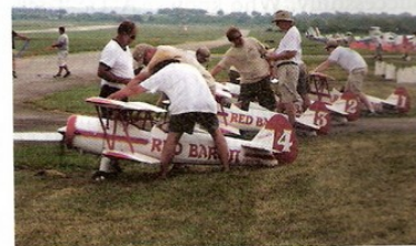
The Red Baron Stearman Team ready to take off.