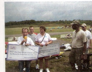
GCRCC presents a check to Cincinnati's Spina Bifida association.