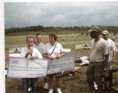
GCRCC presents a check to Cincinnati's Spina Bifida association.