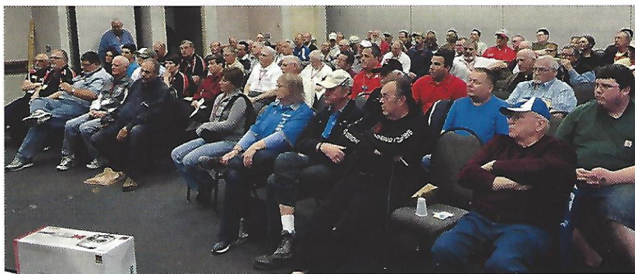
The turnout for the AMA Districts III and VII meet and greet filled Room 314 of the SeaGate Convention Center.

Until next month, fly safely—fly AMA. 🛩️