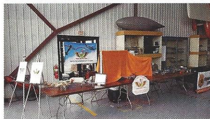
The NEPRCC put together this nice display utilizing flight simulators at the Mid-Atlantic Air Museum WW II weekend.

This kind of promotion is a win-win for everyone involved. Thank you NEPRCC for promoting AMA and our hobby in such a great way to so many people.