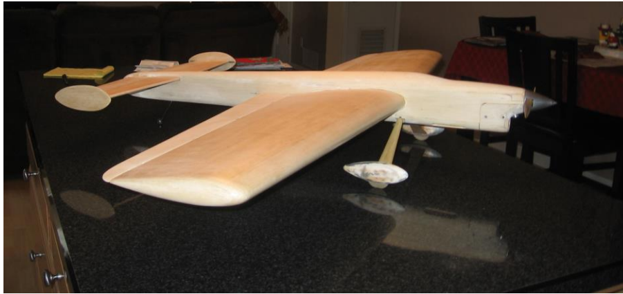
The plane is now framed up, covered, and ready for fillets.