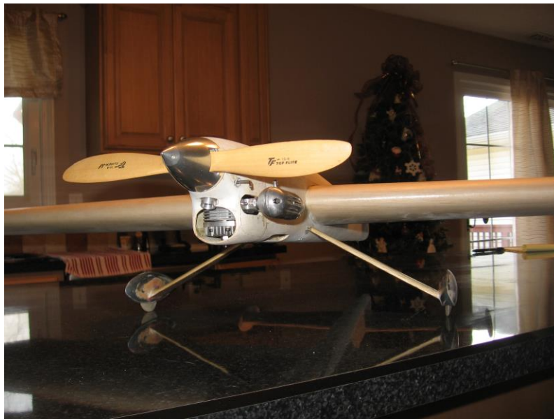
The Stunt Machine is powered by a Magnum 36 with an OS jet stream muffler. It has a Bob Hunt foam wing with molded leading edges.