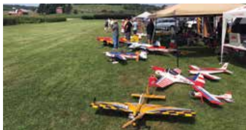
A view down the flightline of the Coshocton Cloud Climbers.