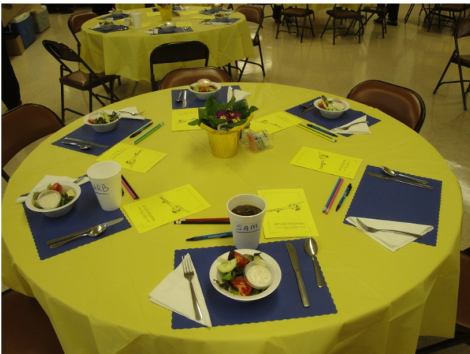
Table decorations at the 2015 Banquet

We are still working to obtain an interesting speaker for this year's banquet. We will have an RC simulator set up, plus show pictures from past banquets and other activities of our Johnstown RC Club.