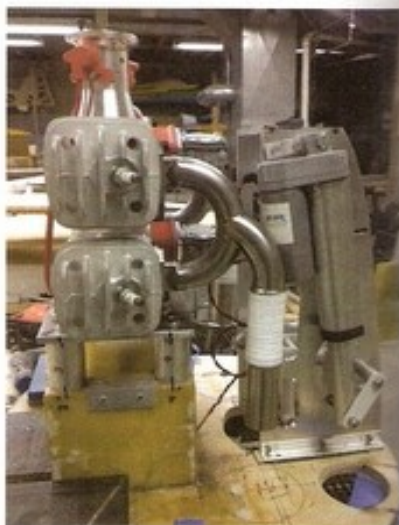
The engine, exhaust, and retract detail on the T-34.