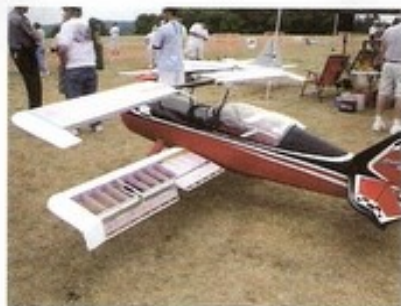
Unique wing construction on the Pitts.

wings are foam core with wood rib overlays. The motor is a 400cc Moki five-cylinder radial. Most of the plane's material came from Home Depot. Its empty weight is 94 pounds. I'm using four Seiko PS050 servos for all the flying control surfaces and using a Spektrum DX18 for guidance."